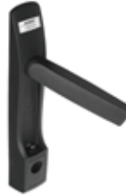
Optional Swing Handle (To replace standard door lock system)