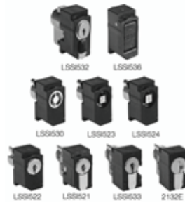
Swing Handle Optional Inserts