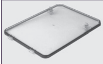
** INSPECTION COVER Transparent Cover mounted on hinge frame